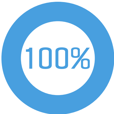
The students who worked with a CIS-C Reengagement Coordinator all graduated!